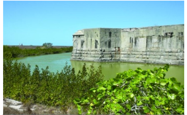
Photo: Fort Zachary Taylor Florida State Park