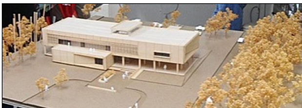
Architects rendering of the finished visitors center.

Glass walls will offer views of the ocean and natural landscape.