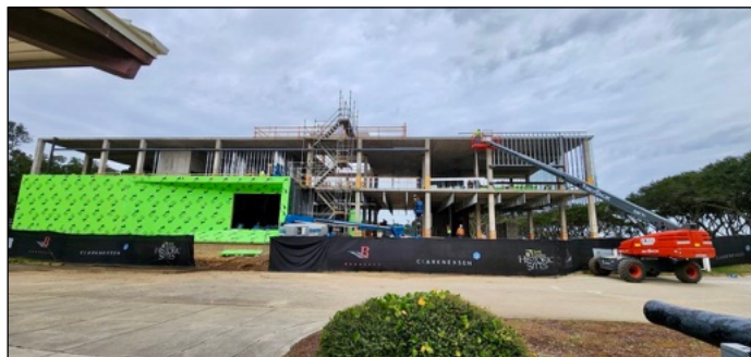
Backside of the new center as of Nov. 15, 2023.

Per CoastalReview.org , construction on a new visitor center is well underway. There will be a 120-person capacity multipurpose room available to rent, a gift shop overlooking the fort's earthworks, a theater that will sit 100 people, and a changeable exhibit gallery of artifacts from the North Carolina Underwater Archeology Center.